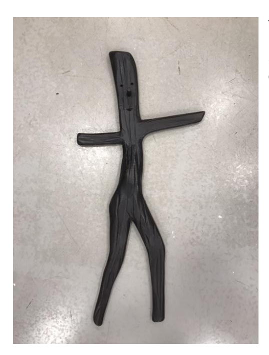
This is Stickman

Stickman is a large wooden stick with arms and legs. He doesn't speak or move and is held by The Gruffalo's Child.